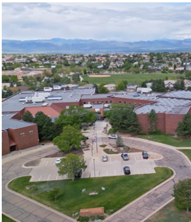
Highlands Ranch High School